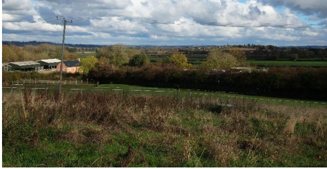
1) From the corner of Dag Lane over steeply contoured grazing fields and hedges toward the distant Welland Valley