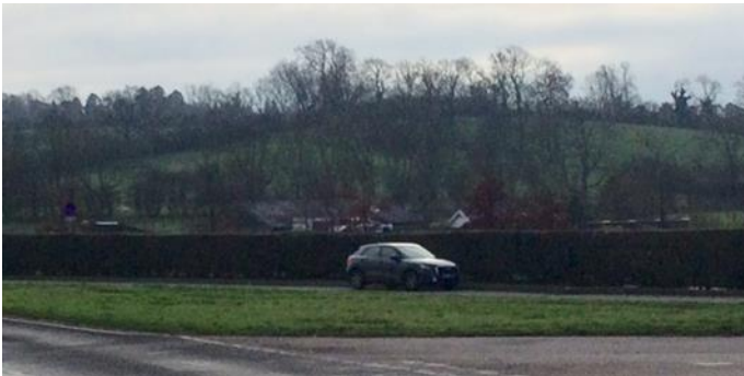
6) South from Leicester Road across the valley and up the bank into the village.