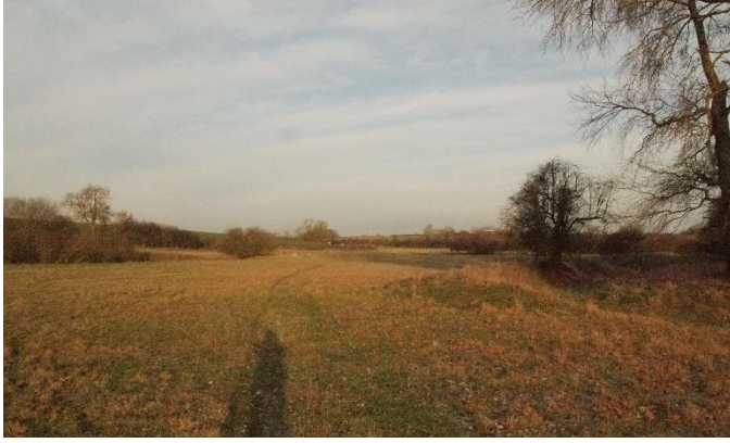
4) From the Welford Arm of the canal (towpath) down and over water meadows to the river Avon and the parish boundary