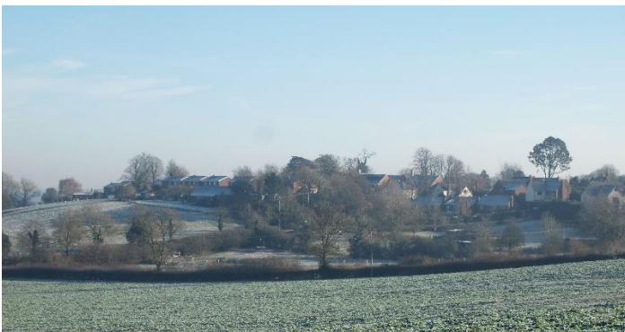
7) From the top of Boaty Lane back into the village