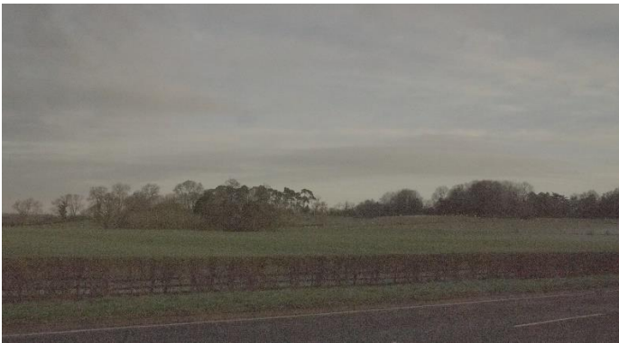
5) Northwest toward the village from Kilworth Road close to the marina