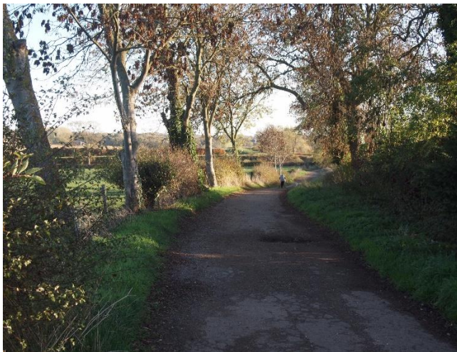
3) Along Butt Lane both north and south, into the village and south toward the airfield