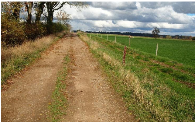
2) Panoramic view from Mowsley Road bridleway northeast to the Laughton Hills and East along the Welland Valley, including distant view of Theddingworth church spire.